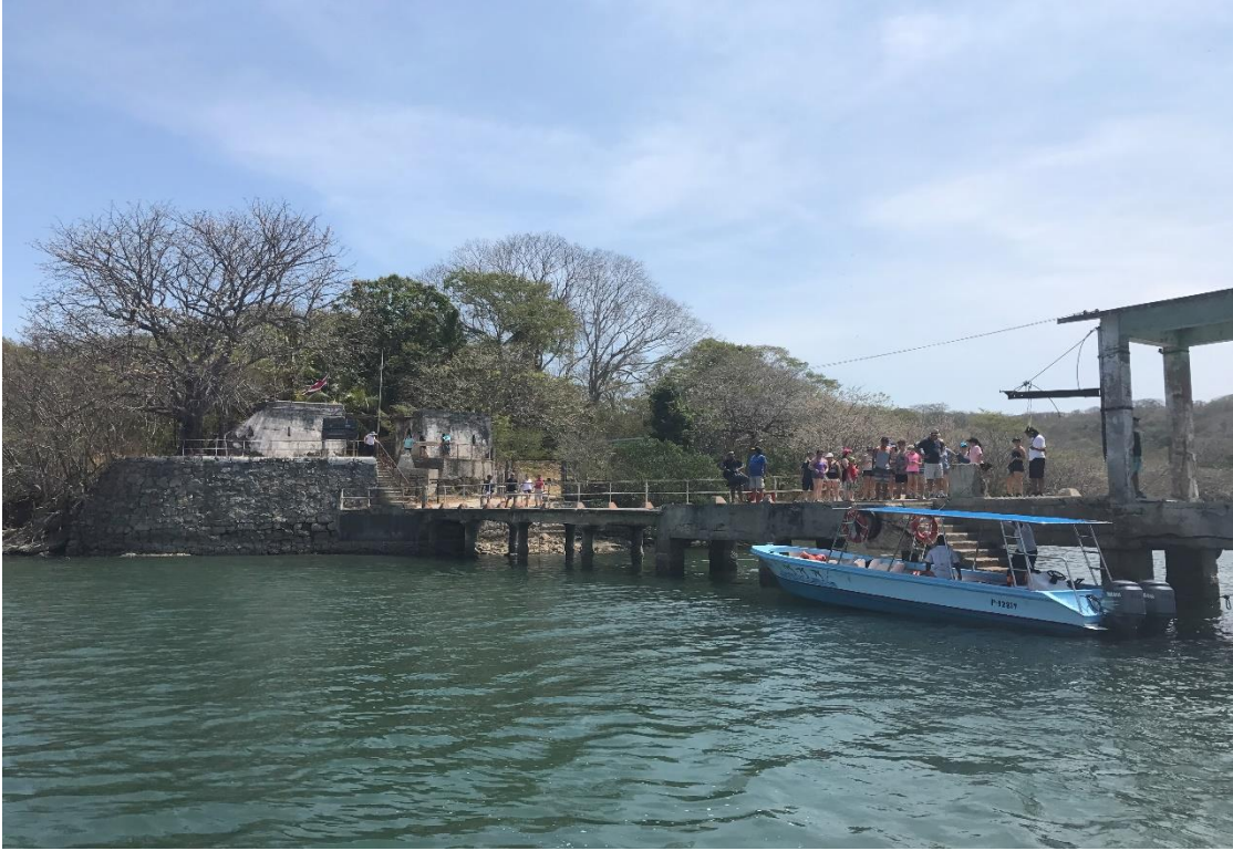
ISLA SAN LUCAS (THE ISLAND OF SINGLE MEN)

Visit some of our beautiful islands in the Gulf of Nicoya, San Lucas Island and Tortuga Island amongst many others.