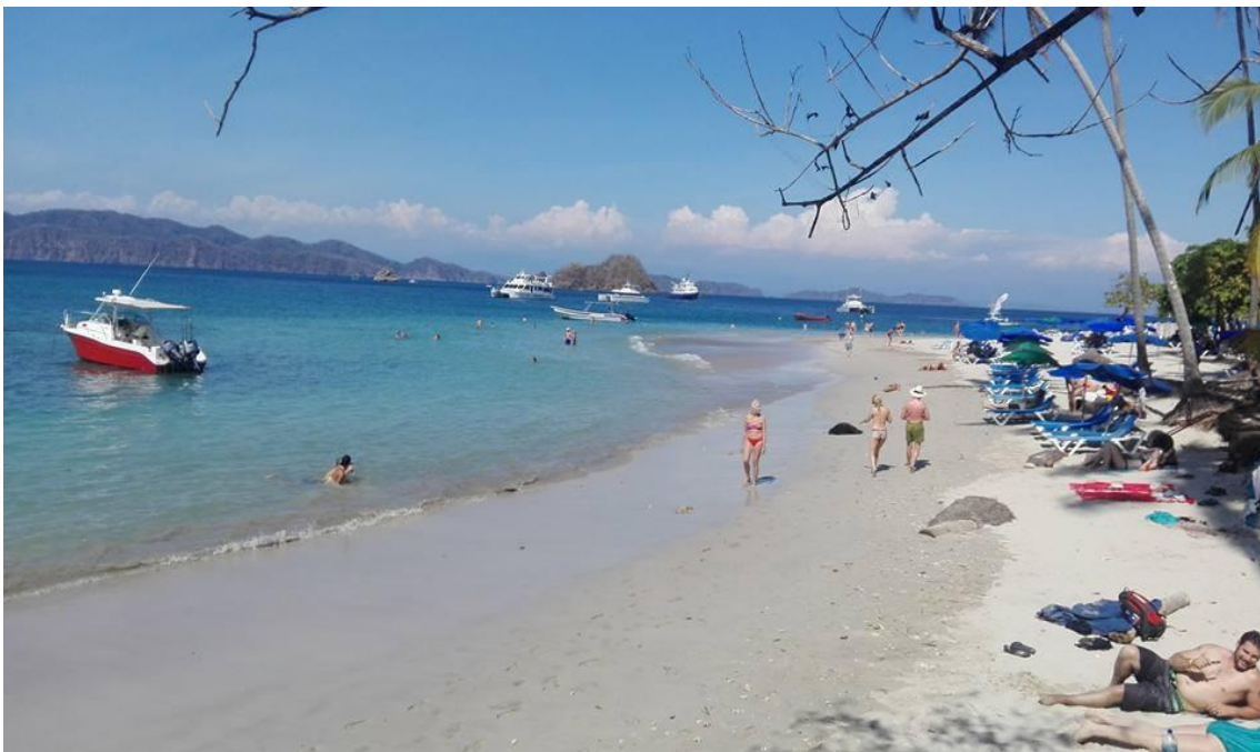
ISLA TORTUGA (TURTLE ISLAND)